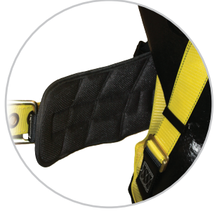
Breathable, Moisture-Wicking Padding