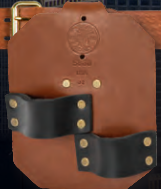
HEAVY-DUTY SPUD WRENCH HOLDER 5860