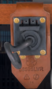
ADJUSTABLE CONNECTING BAR HOLDER 5859SLVR