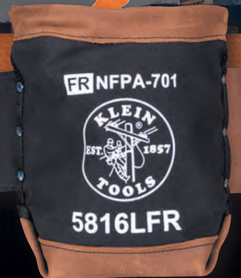
HYBRID LEATHER AND FLAME-RESISTANT CANVAS BOLT BAG 5816LFR