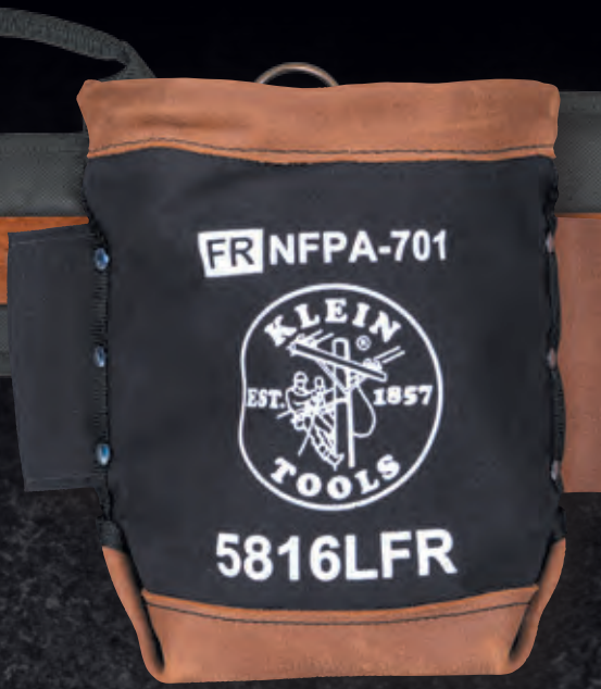
HYBRID LEATHER AND FLAME-RESISTANT CANVAS BOLT BAG 5816LFR