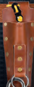
TOOL HOLDER TENSION STRAPS 5890