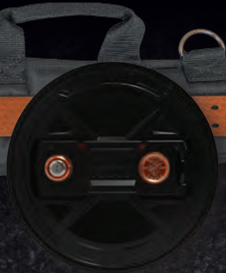
QUICK-LOCK TIE WIRE REEL 27500