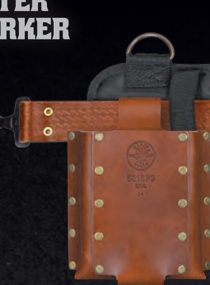
THREE POCKET LEATHER TOOL HOLDER 5818P3