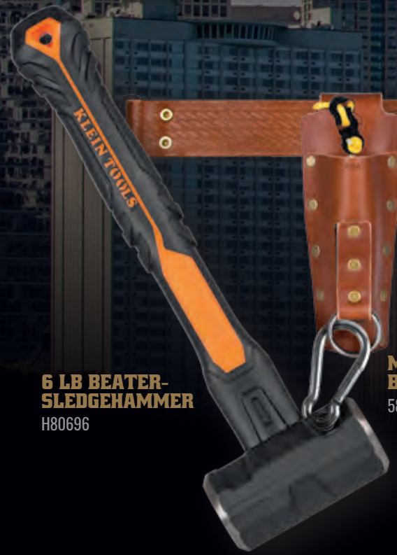
6 LB BEATER-SLEDGEHAMMER H80696